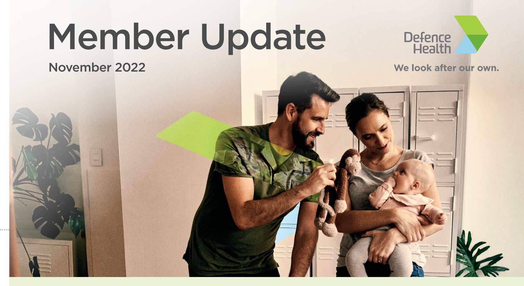
In this update Message from the CEO | Make the most of your extras | Legacy Torch Bearers | Short stay, no-gap joint replacement | My Baby | Annual Report | Christmas Hours | Fund Rules